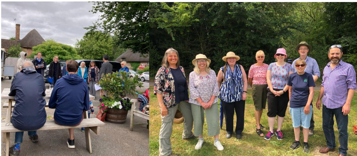
Entertaining in Vernham Dean